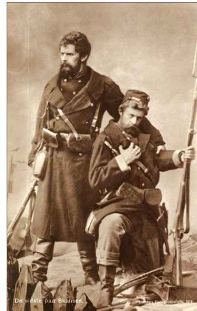
De sidste paa Skansen

Journal of the Danish American Heritage Society