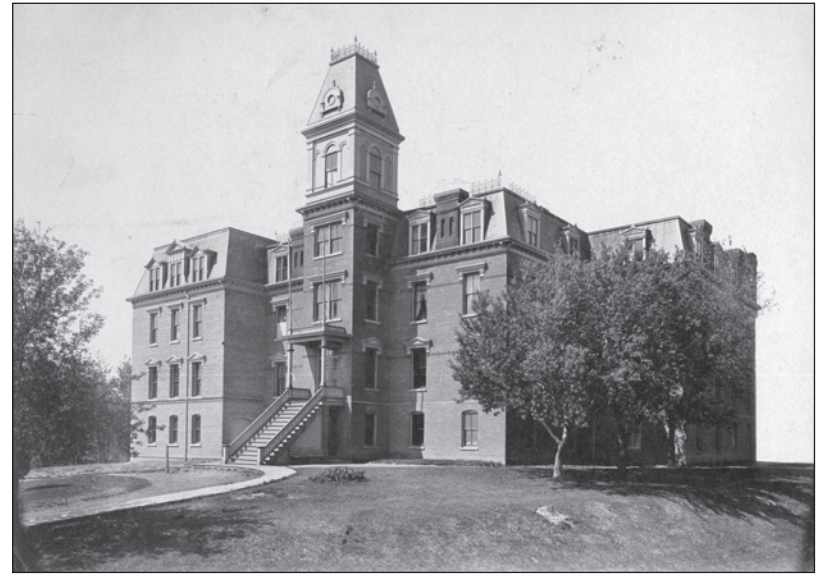
Old Main on the campus of Trinity Seminary and Dana College, c. 1900

Journal of the Danish American Heritage Society